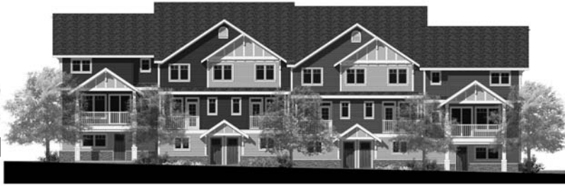
Units 1 - 6 elevation